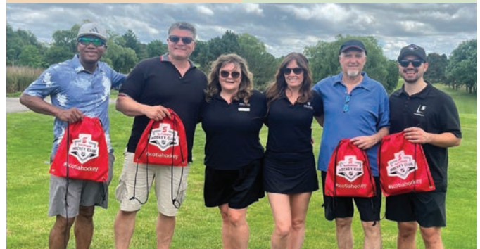
GLEN EAGLE GOLF DAYS