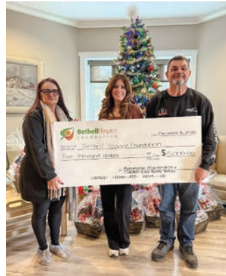
AUTOMOTIVE MAINTENANCE BOTTLE RETURN

Thank you for your belief in the importance of Bethell Hospice in our community.