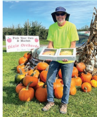
DIXIE ORCHARDS PIE SALES