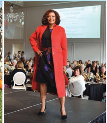
DIAMOND IN THE HILLS FASHION SHOW