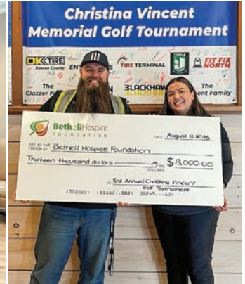
CHRISTINA VINCENT MEMORIAL GOLF TOURNAMENT