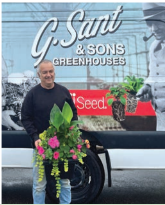
GEORGE SANT & SONS PLANT SALE