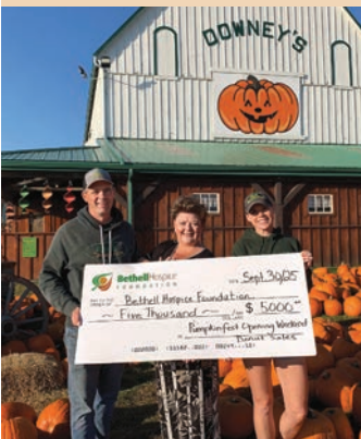
DOWNEY'S FARM MARKET