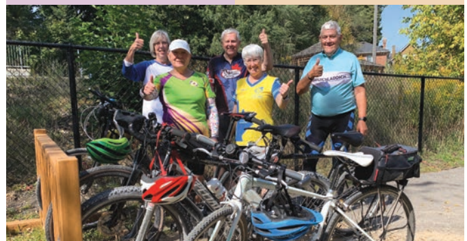
BIKE FOR BETHELL HOSPICE