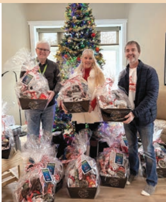
NASHVILLE ROAD COMMUNITY CHURCH