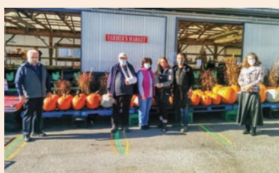
Rock Garden Farms