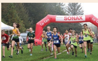
310 Running Club – Don Olson Classic