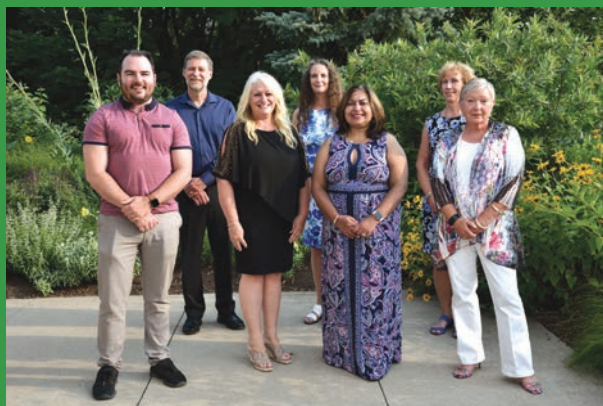
Bethell Hospice Board