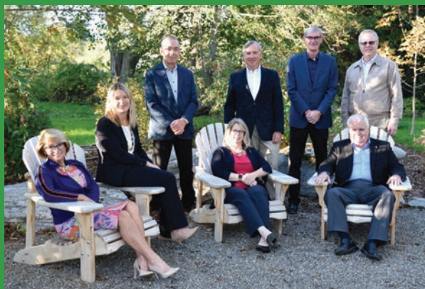
Bethell Hospice Foundation Board