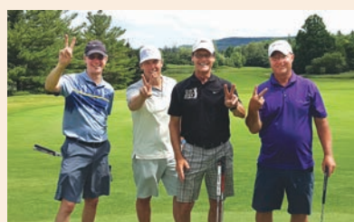
Summer Solstice Golf Marathon