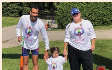
Patricia Lopez Memorial Triathlon