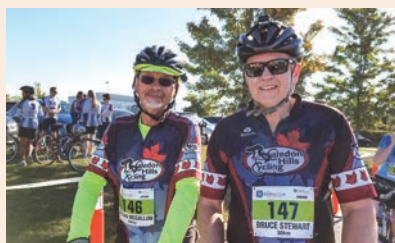
Healing Cycle Ride