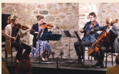
Caledon Music Festival