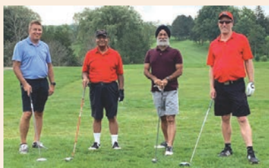
Glen Eagle Golf Club – Golf Days