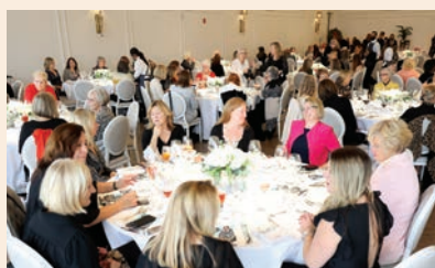
Diamond in the Hills Fashion Show

The unwavering support of our Community Partners and Fundraising Event Organizers helped to keep the doors of Bethell Hospice open, and all programs and services available at no charge .