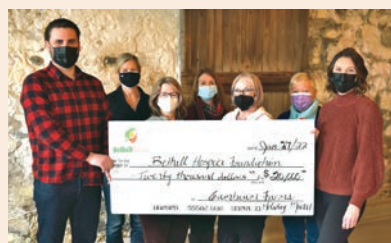
Cambium Farms – Holiday Market