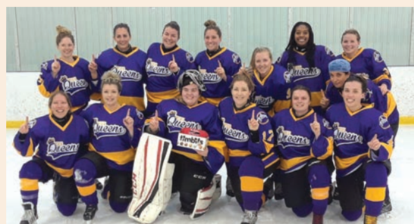
CALEDON WOMEN'S HOCKEY LEAGUE – UDDER TOURNAMENT