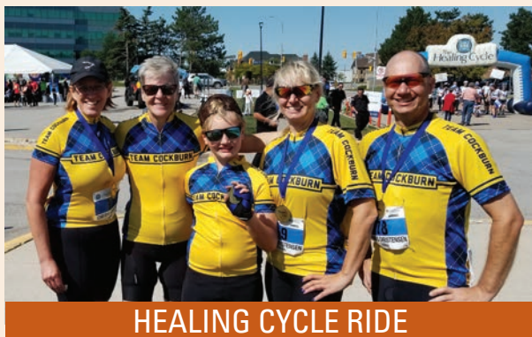
HEALING CYCLE RIDE