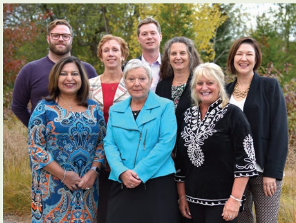
BETHELL HOSPICE BOARD

We have begun the tough work of examining our policies and procedures from every angle to ensure they are based on best practice and provide optimal care to those we serve. A strong team of outstanding staff and volunteers remains our priority, enabling us to provide excellent palliative and end-of-life care, both in the hospice and throughout the community.