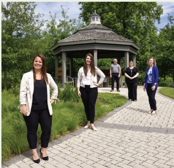
PSYCHOSOCIAL SPIRITUAL CARE TEAM

For many years, our residential care has been the heart of Bethell Hospice. This year, a renewed focus was placed on building our community programs and services to meet the ever-growing palliative care needs in the community.