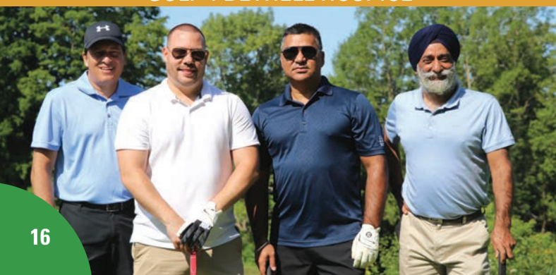
HOCKLEY VALLEY RESORT – GOLF 4 BETHELL HOSPICE