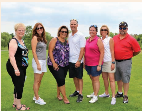
DAWNA HUNT MEMORIAL GOLF TOURNAMENT