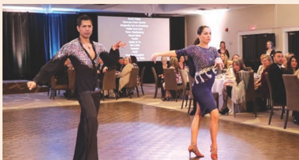
HOCKLEY VALLEY RESORT – DINNER & DANCING DATE NIGHT