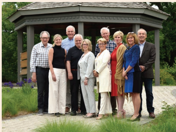
BETHELL HOSPICE FOUNDATION BOARD

Thanks to the generosity of our donors, sponsors, community partners and volunteers, 2019 was Bethell Hospice Foundation's most successful year ever, raising almost $1,500,000 in support of Bethell Hospice residential and community programs and services.