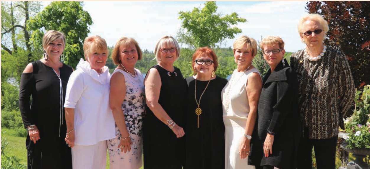
DIAMOND IN THE HILLS FASHION SHOW