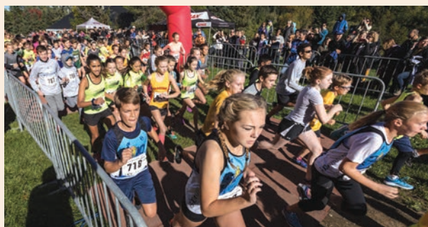
DON OLSON CLASSIC