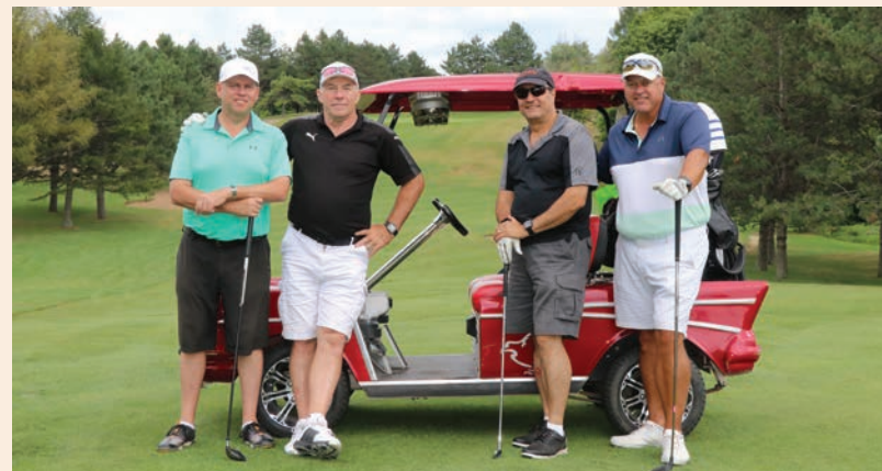
GLEN EAGLE CHARITY CLASSIC GOLF TOURNAMENT

Faith Fellowship Church of Dufferin County