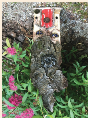
Pixie Property Homes