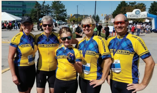
HEALING CYCLE RIDE