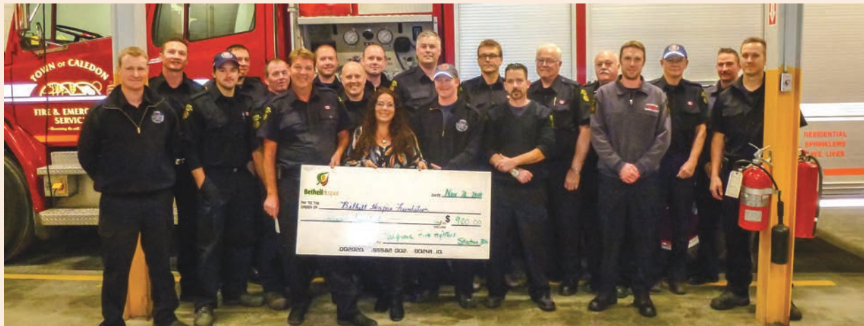
PALGRAVE FIREFIGHTERS ASSOCIATION PANCAKE BREAKFAST

Palgrave Firefighters Association Pancake Breakfast