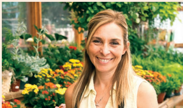
ROCK GARDEN FARMS PLANT SALE

Rock Garden Farms 30 th Anniversary Plant Sale