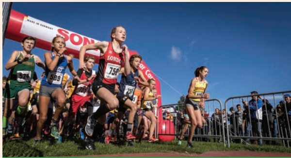
DON OLSON CLASSIC