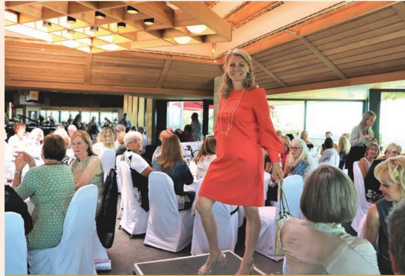
DIAMOND IN THE HILLS FASHION SHOW