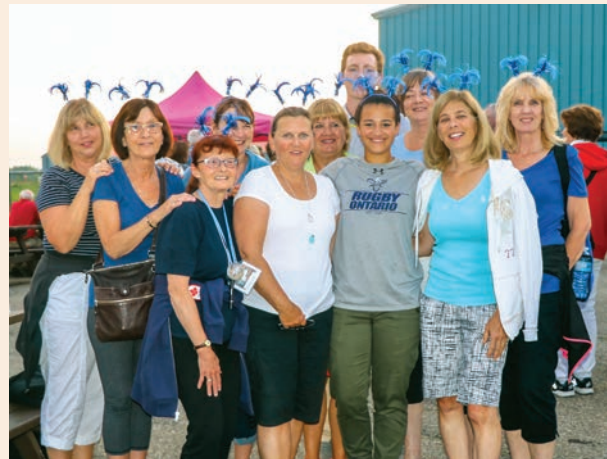
LIGHT UP THE RUNWAY