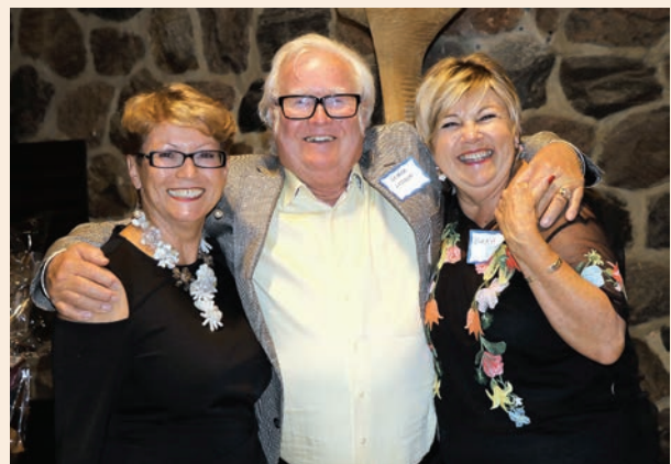
McMICHAEL: THE LUXURY OF LINCOLN MEETS THE ART OF CANADA

McMichael: The Luxury of Lincoln Meets the Art of Canada