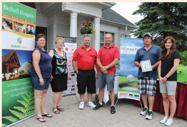
DAWNA HUNT MEMORIAL GOLF